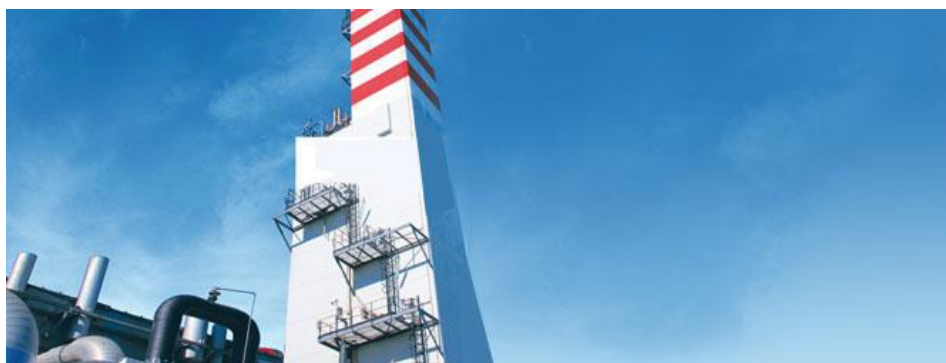
Picture 1a and 1b – CCGT power plant