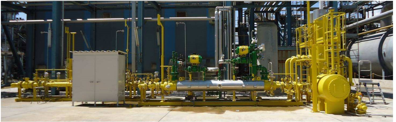
New Fuel Gas treatment station