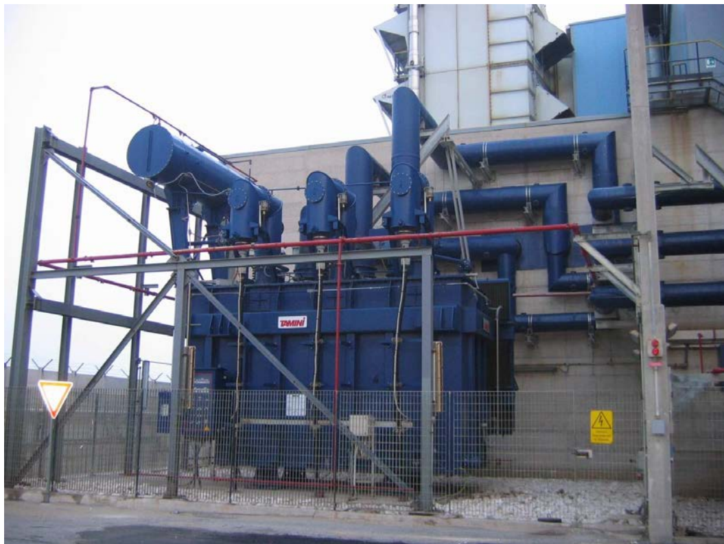
GT step-up transformer