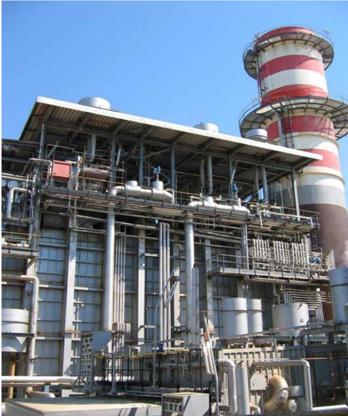
Heat Recovery Steam Generator (HRSG)