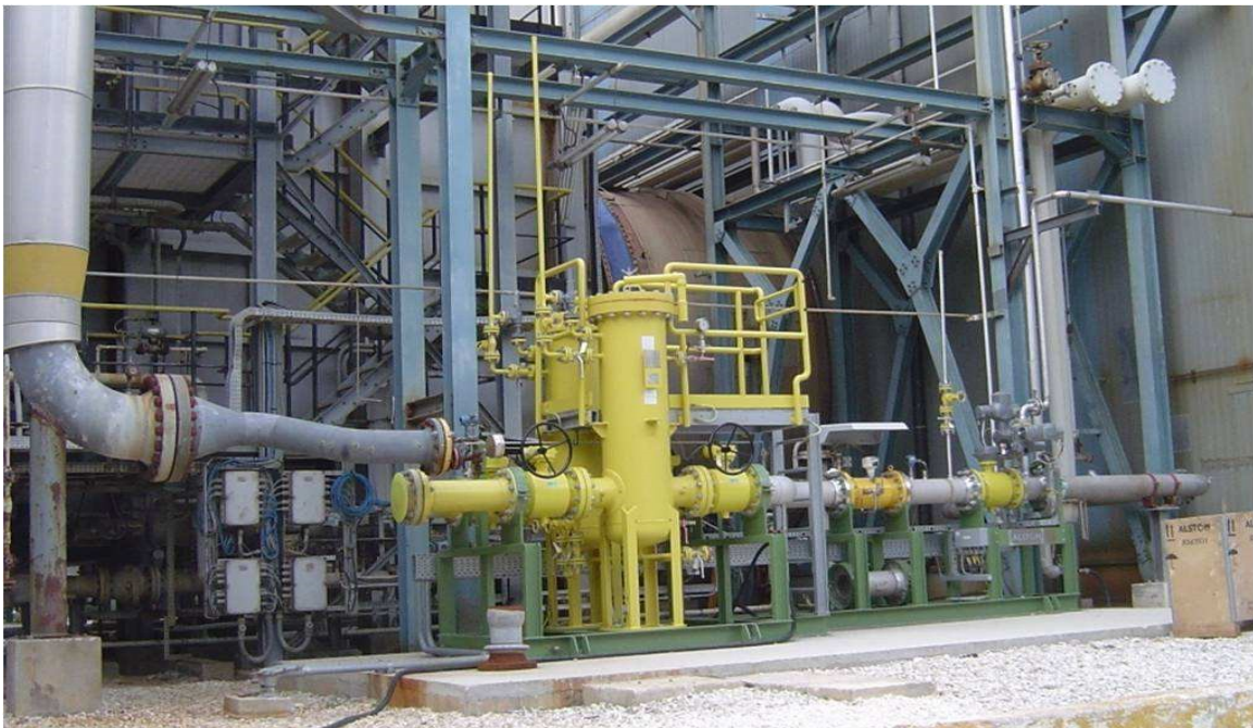
New GT Filtration system